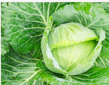
GOLDEN ACRE CABBAGE

FRUIT WEIGHT: 8-12 KG PER FRUIT DAYS TO MATURITY: 75-85 DAYS YIELD POTENTIAL: 30-40 TONS PER HECTARE