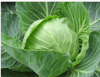
BRUNSWICK (BOSTON) CABBAGE

HEAD SHAPE & SIZE: COMPACT, ROUND HEADS HEAD WEIGHT: 1.5-2.5 KG DAYS TO MATURITY: 65-75 DAYS FROM TRANSPLANTING DISEASE RESISTANCE YIELD POTENTIAL: 25-30 TONS PER HECTARE PERFORMS WELL IN COOL SEASONS