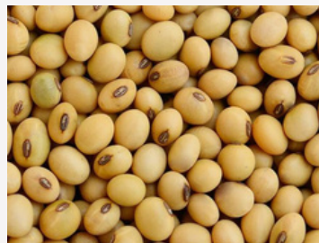
AMAC KAFUE SOYA BEANS

DROUGHT TOLERANT VERY EARLY MATURITY (90 - 120 DAYS) HIGH YIELD : 4MT PER HECTARE SPACING 40CM. SEED RATE 100KG/ HECTARE