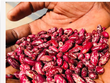
AMAC LUNGWE BUNGWE BEANS